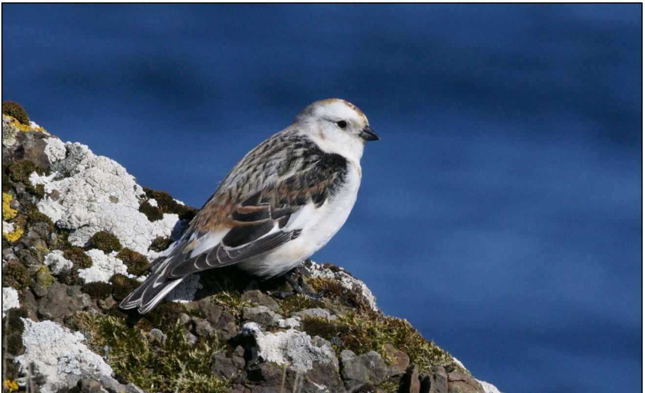
Snow Bunting

We had perfect conditions for our trip to Flatey Island. Here we enjoyed close-up views of Red-necked Phalaropes and Snow Buntings, as well as many pale-bellied Brent Geese and Atlantic Puffins. In the afternoon, we headed west along the Snaefellsnes peninsula, enjoying both Glaucous and Iceland Gulls