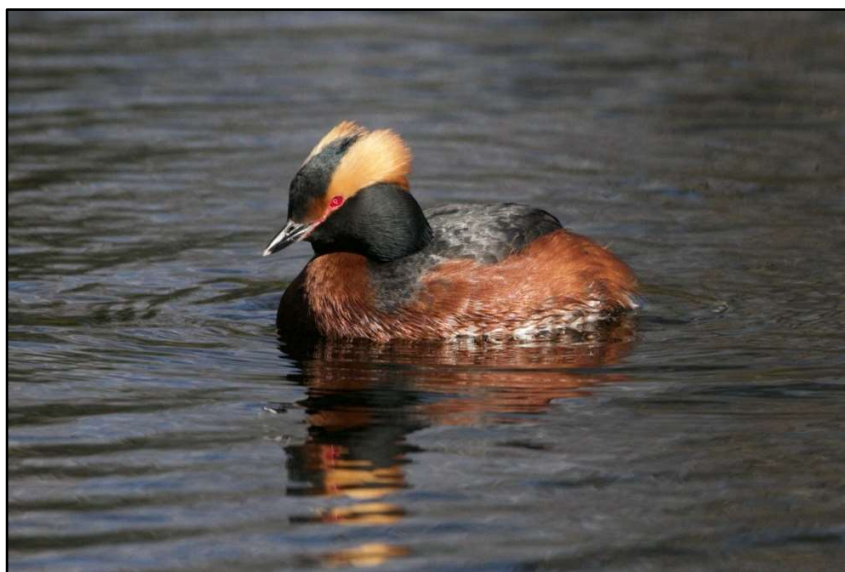
Horned Grebe

We spent some time seawatching at Gardur