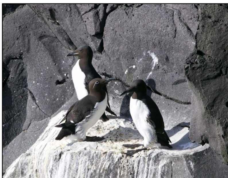
Brännich's and Common Guillemots / Thick-billed and Common Murres

Our journey to Lake Myvatn was punctuated by many short stops. The most notable birds were two groups of stunning Harlequin Ducks on a fast-flowing river, but we also found numerous Pink-footed Geese, two more Iceland Gulls, another Merlin, and several more Great