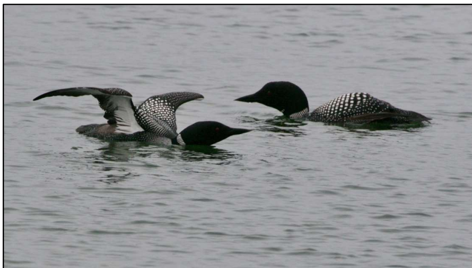
Great Northern Divers / Common Loons

Lighthouse. Hundreds of Manx Shearwaters were gathering offshore, but distant whale blows were too far out to be identifiable, although several leaping White-beaked Dolphins were seen by some. Our rarest find of the trip was a Peregrine Falcon which suddenly appeared, dashing across the shoreline in pursuit of a wader. Sadly, it was not a Gyr Falcon, but in Icelandic terms it was a much more interesting bird, as the species barely occurs annually there.